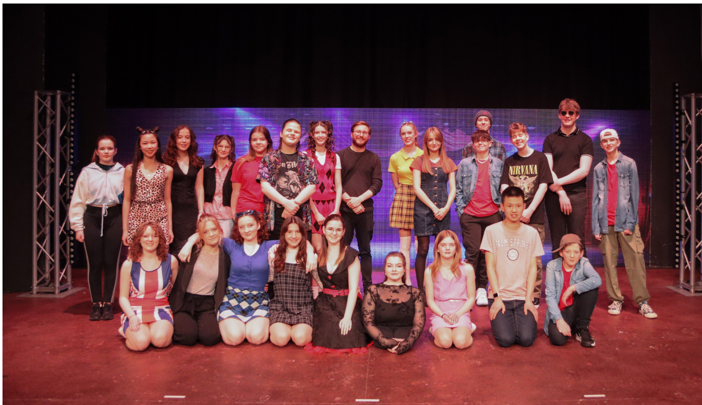
The entire cast of GYMS before their performance at Inverurie Town Hall.