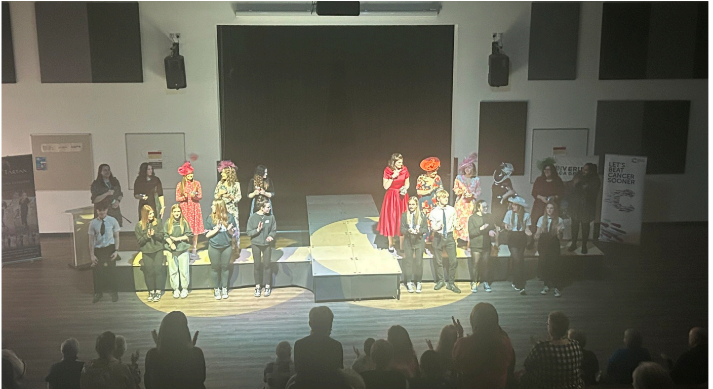
The Creative Industries charity Fashion Show was a resounding success.