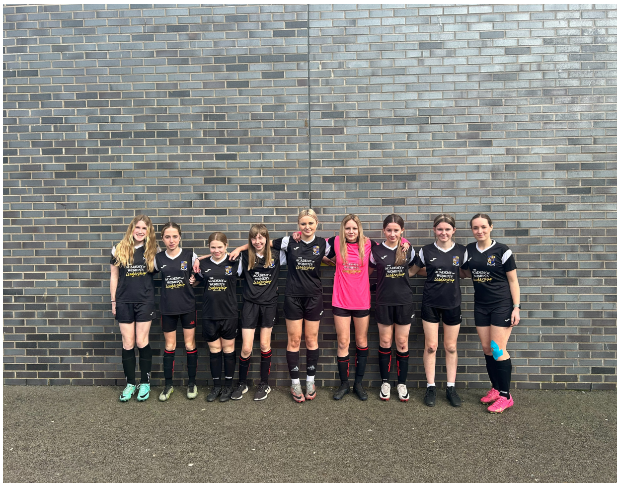
The Junior Girls football team were crowned the victors after their recent match against Turriff.

T his term, there has been a huge amount of sporting success for students at Inverurie Academy.