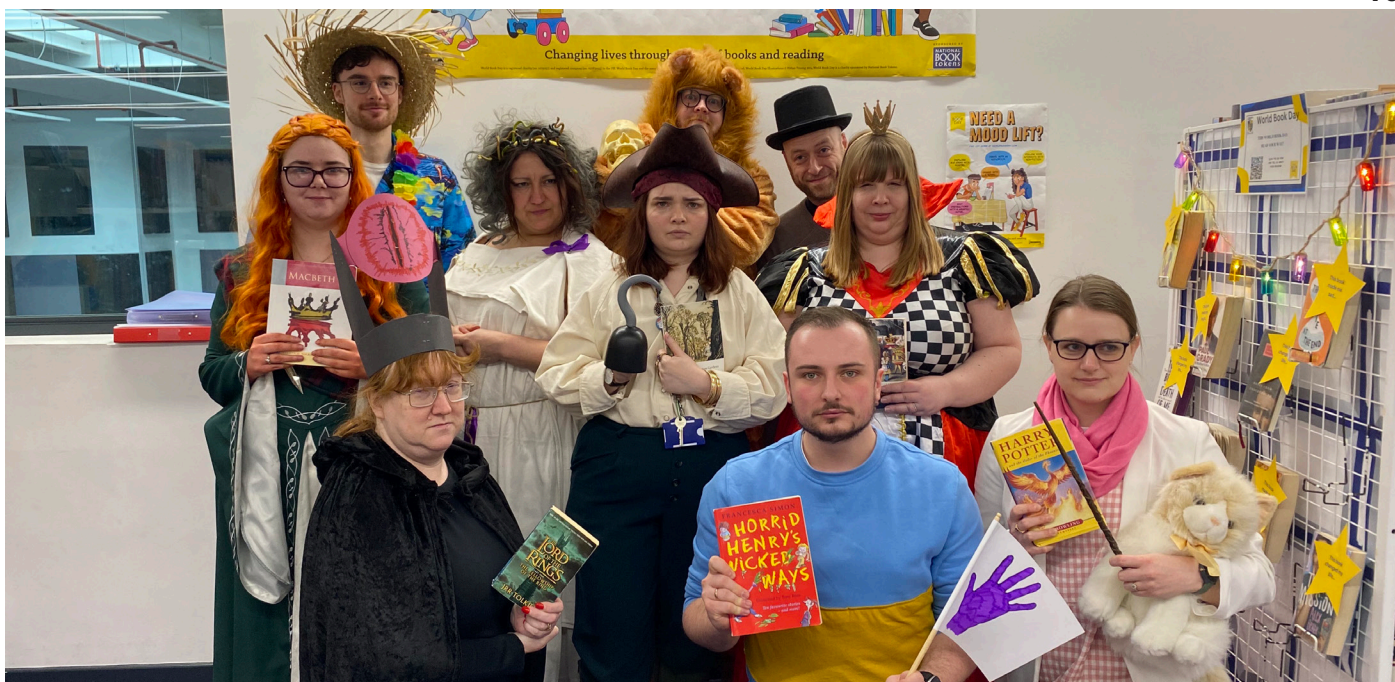
Inverurie Academy's English faculty went all out this year with a sinister selection of villainous characters from some of their favourite novels.